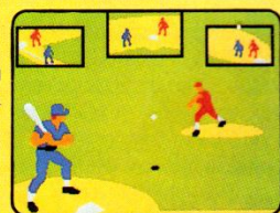
Super Action Baseball